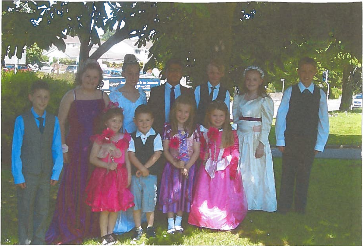
The Wedding June 2013