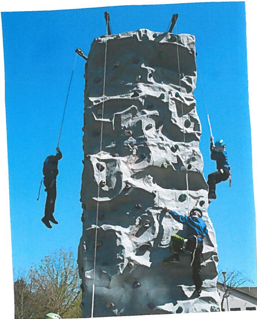
Sponsored climb in May 2013.