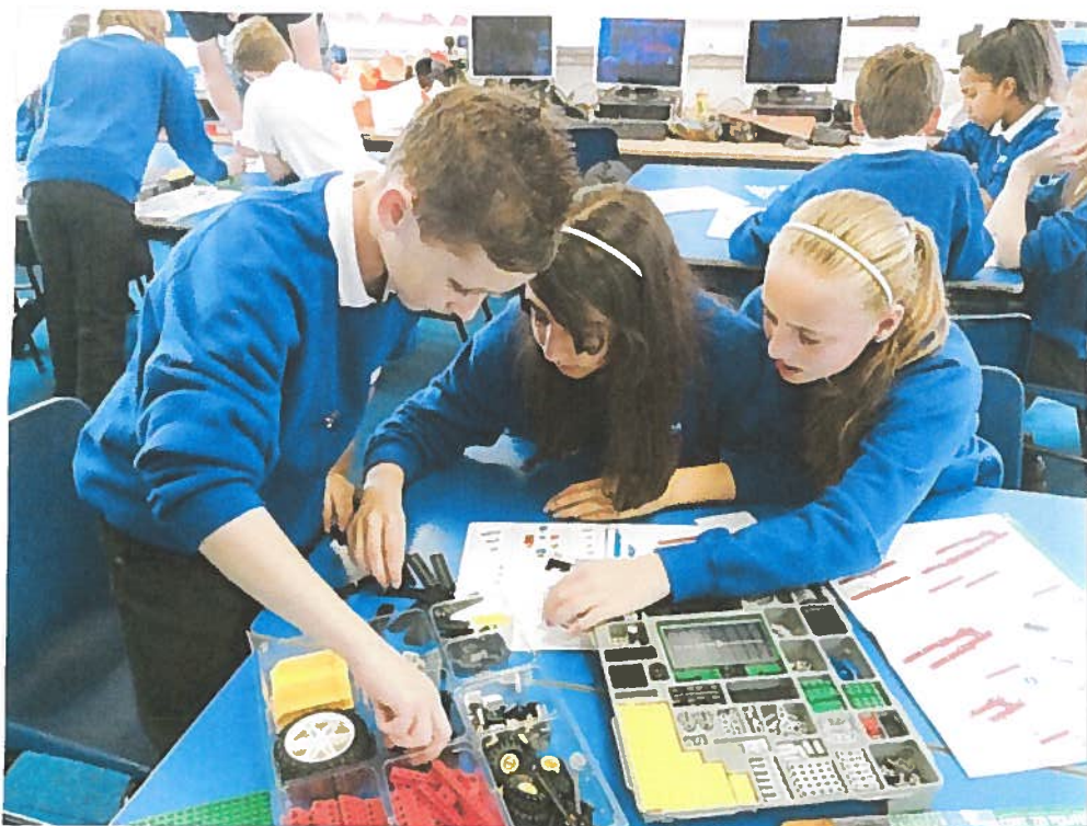
BP workshop 4.10.13