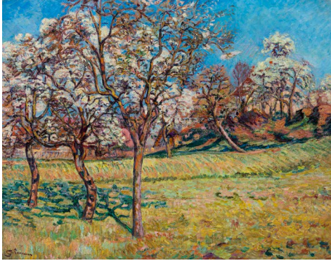
Les Pommiers à Damiette , Jean Baptiste Armand Guillaumin, 1893

Can you find these blossoming apple trees?