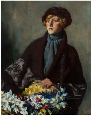
Kitty of Frying Pan Alley (detail), Sir Oswald Birley, c. 1921

Take a close look at this painting of a flower seller. Tick the boxes as you complete each task.