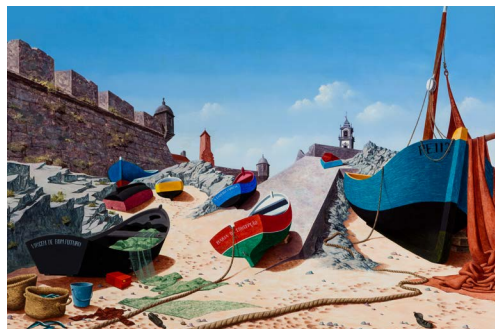
The Slipway at Peniche, Tristram Hillier, 1948