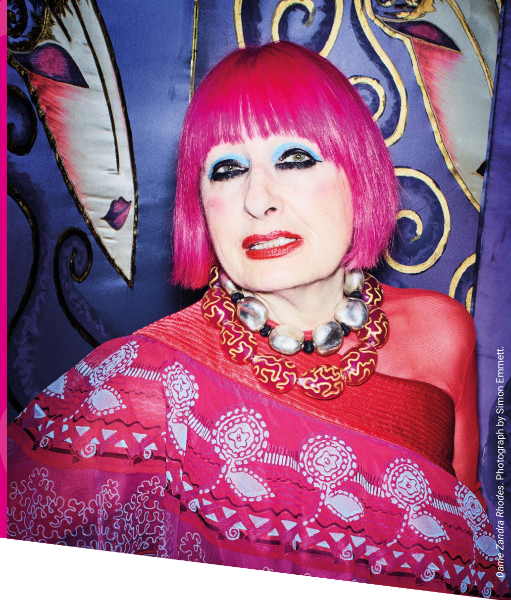
Dame Zandra Rhodes.