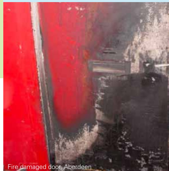
Fire damaged door, Aberdeen

To arrange collection of large items, visit www.aberdeency.gov.uk/waste .