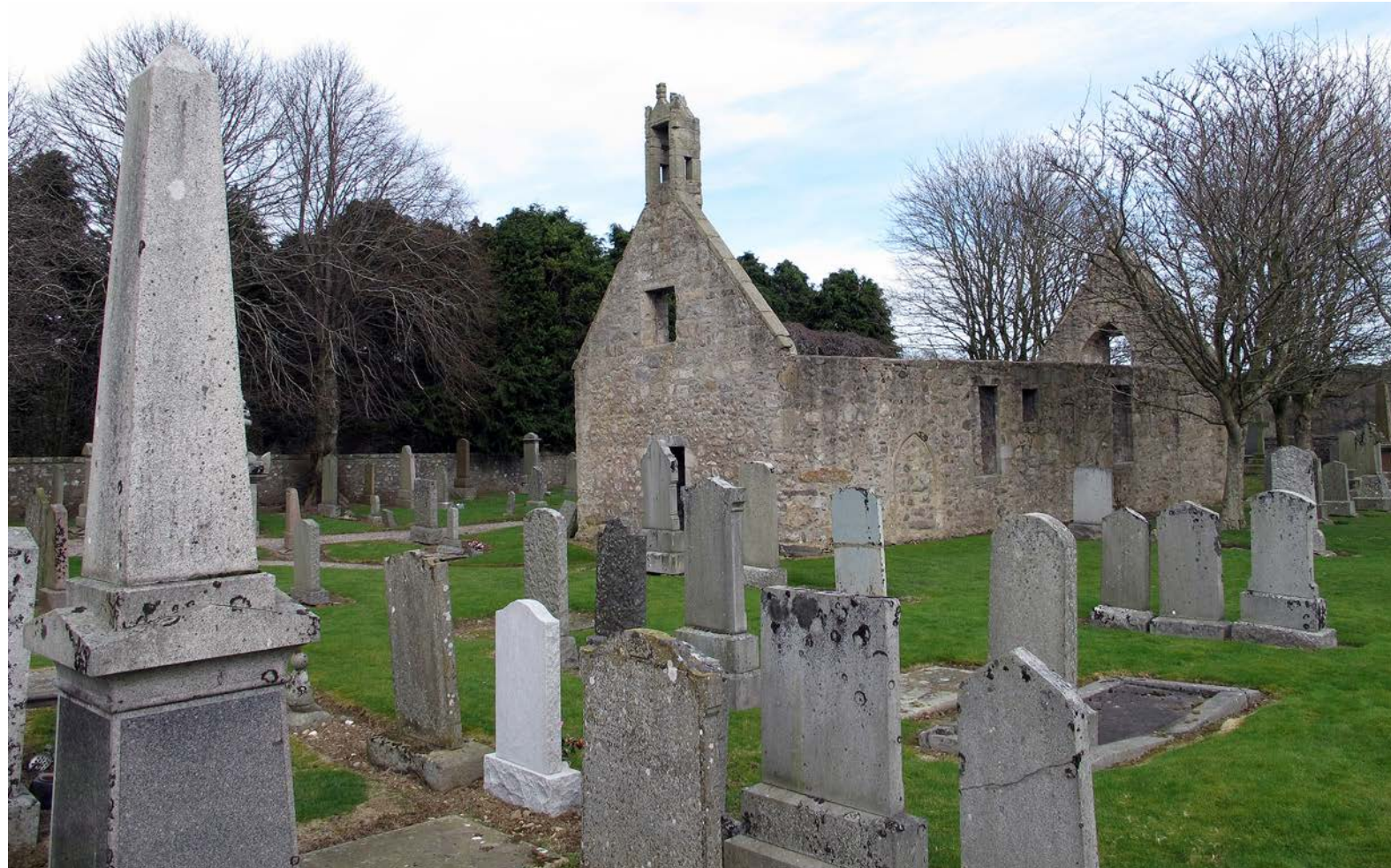
SM8843 St Fergus's Church Old Parish Church and graveyard, Pitmedden Road, Dyce