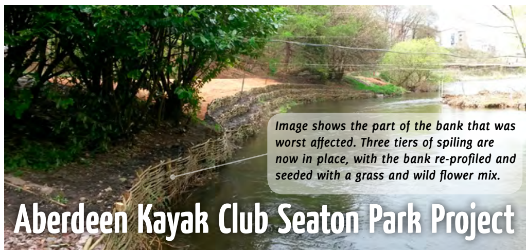
Image shows the part of the bank that was worst affected. Three tiers of spiling are now in place, with the bank re-profiled and seeded with a grass and wild flower mix.

The film is free to download and use, and can be viewed at: www.youtube.com/watch?v=4owglBdMx3U