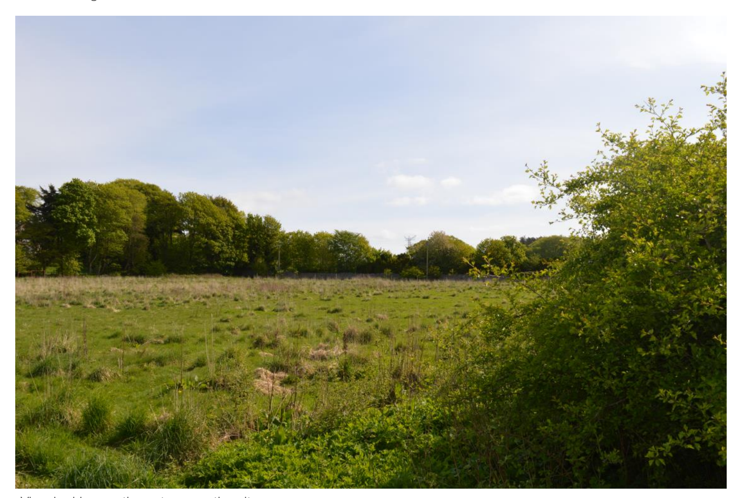
View looking north east across the site