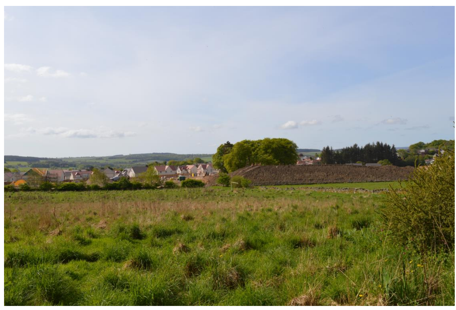
View looking south across the site