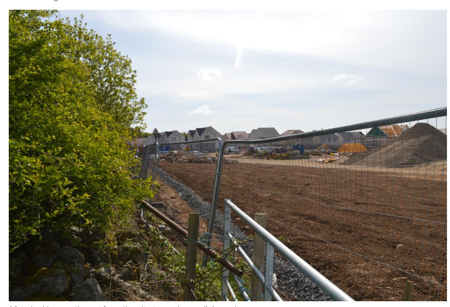
View looking south east from the site towards new link road