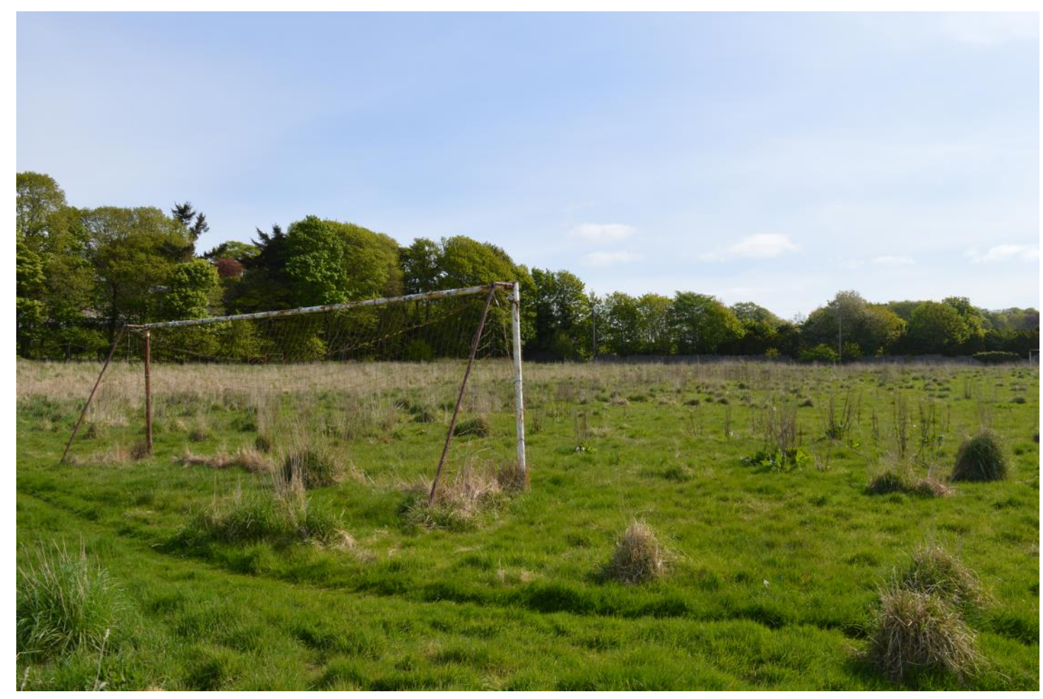
View looking north east across the site