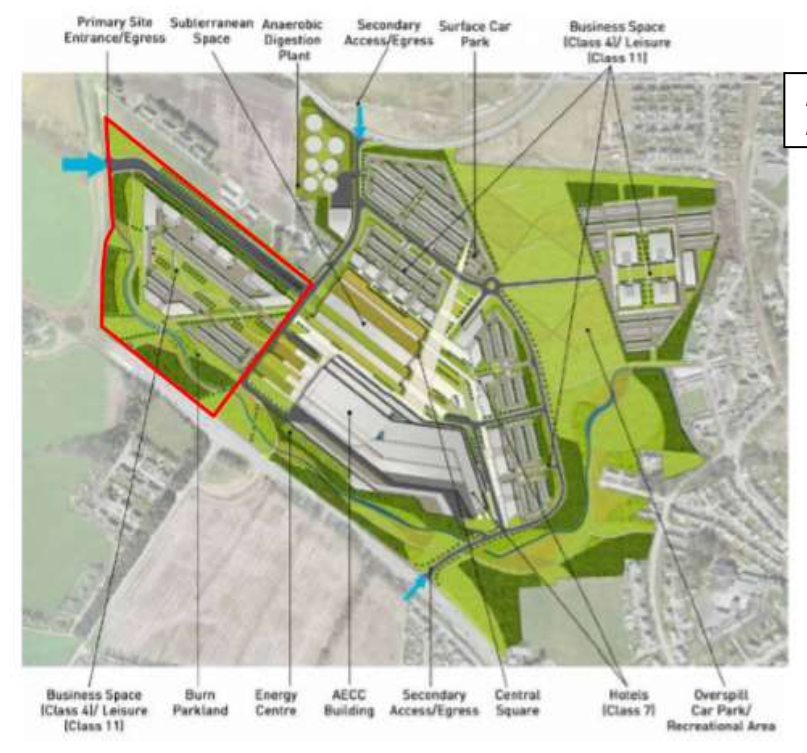
Figure 1: Rowett North Masterplan Extract with bid site identified in red.

Please refer to the attached OS Plan submitted along with this Development Bid which identifies the site within the context of the surrounding area. Figure 1 provides an extract from the approved Rowett North Masterplan, highlighting the site within the context of the mix of uses proposed for the site.