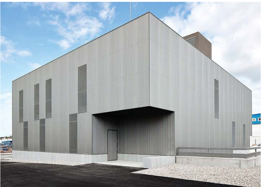
VERTICAL METAL CLADDING