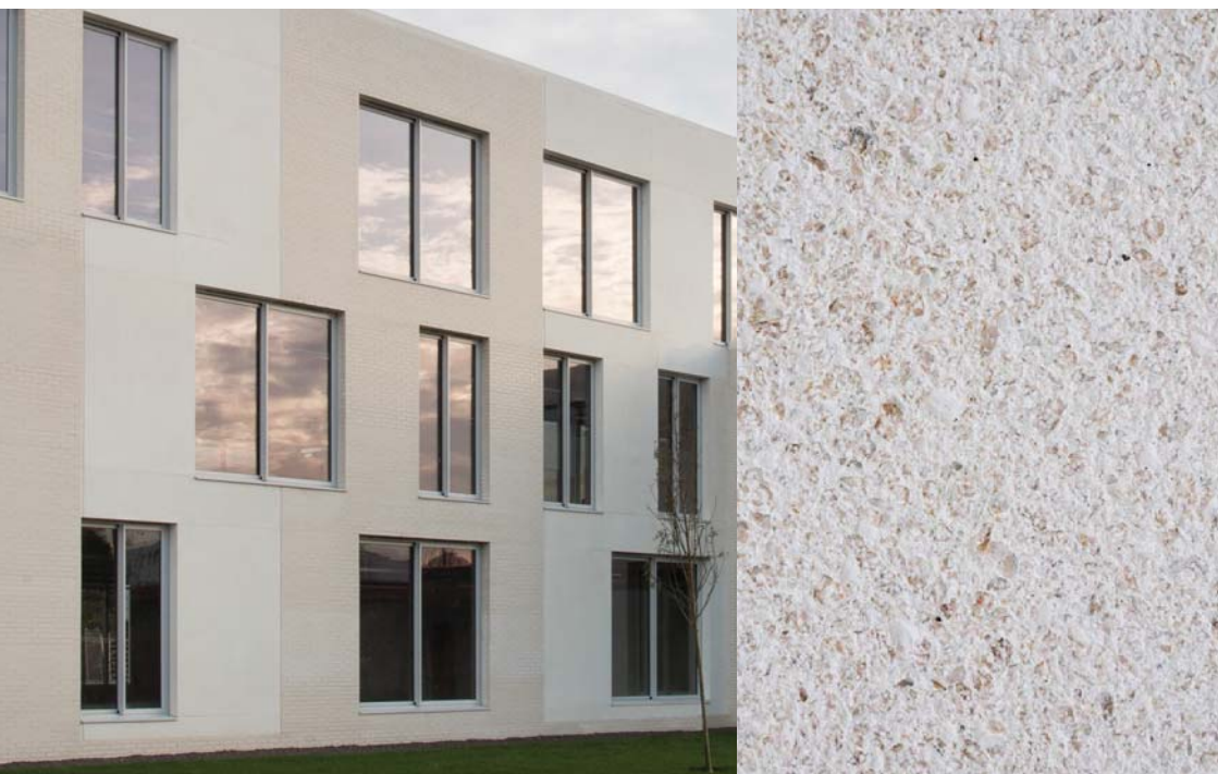
WHITE CONCRETE CLADDING