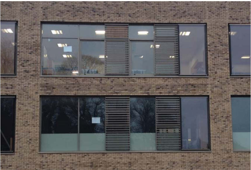
FULL HEIGHT GLAZING