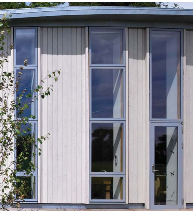
VERTICAL TIMBER CLADDING