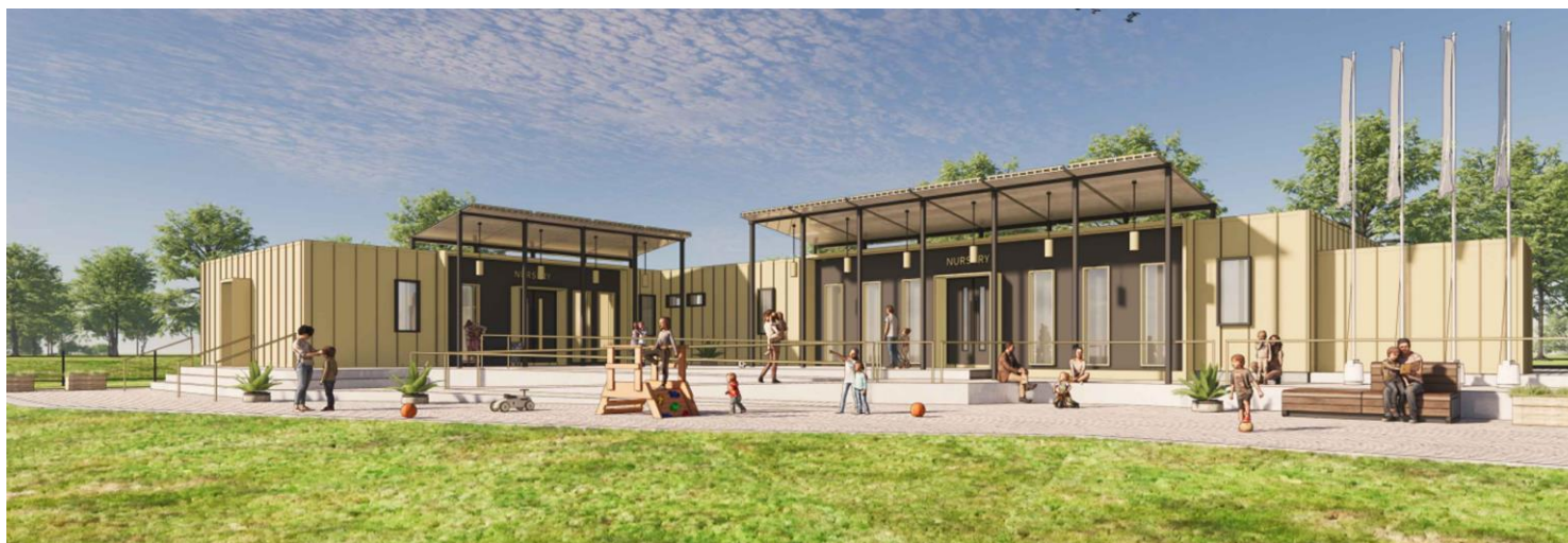
Kirkhill Primary School

Where modular buildings are to serve as classroom space for a school, permission may be granted without time condition provided the design quality is of a high standard.