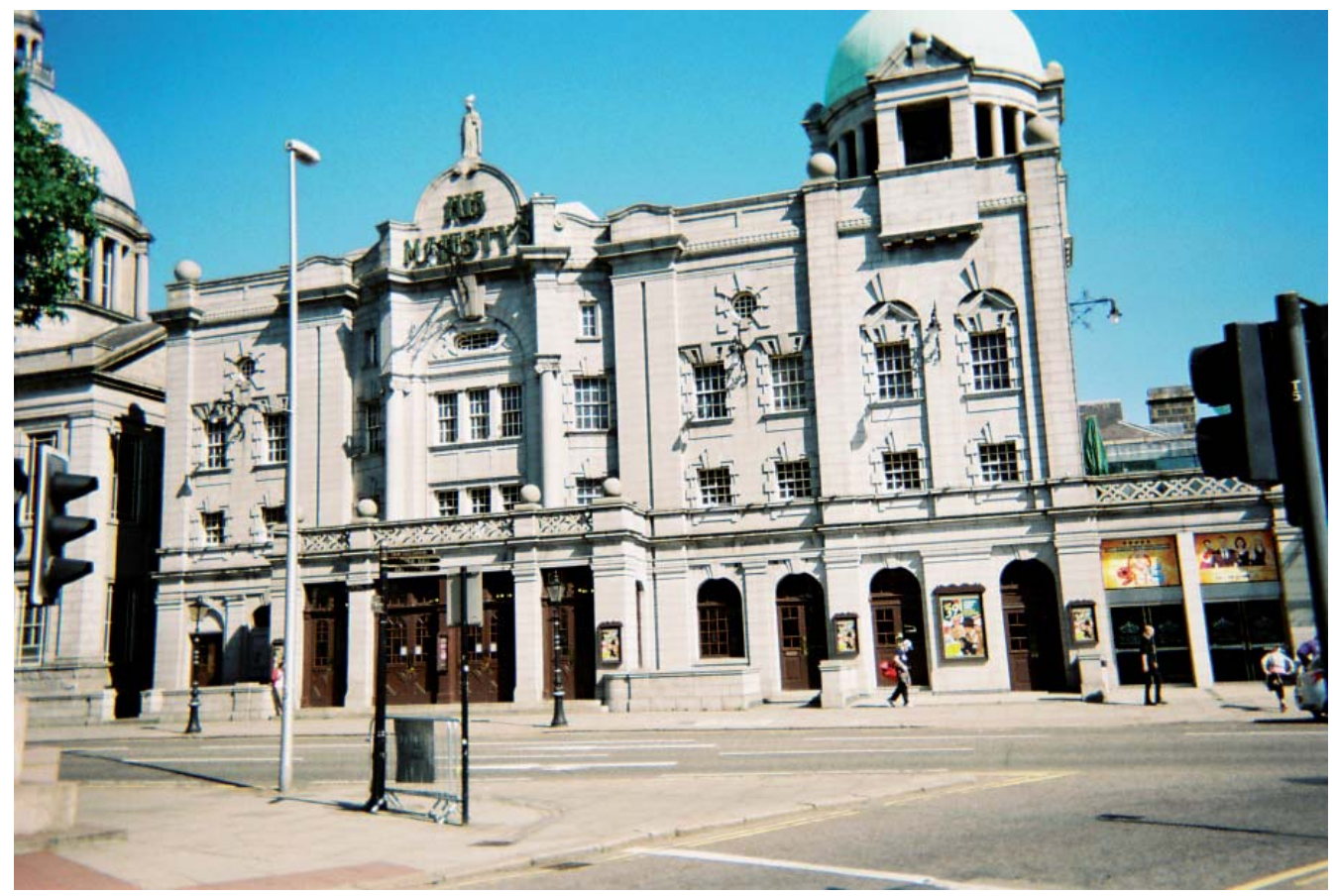
Granite Heritage HMT