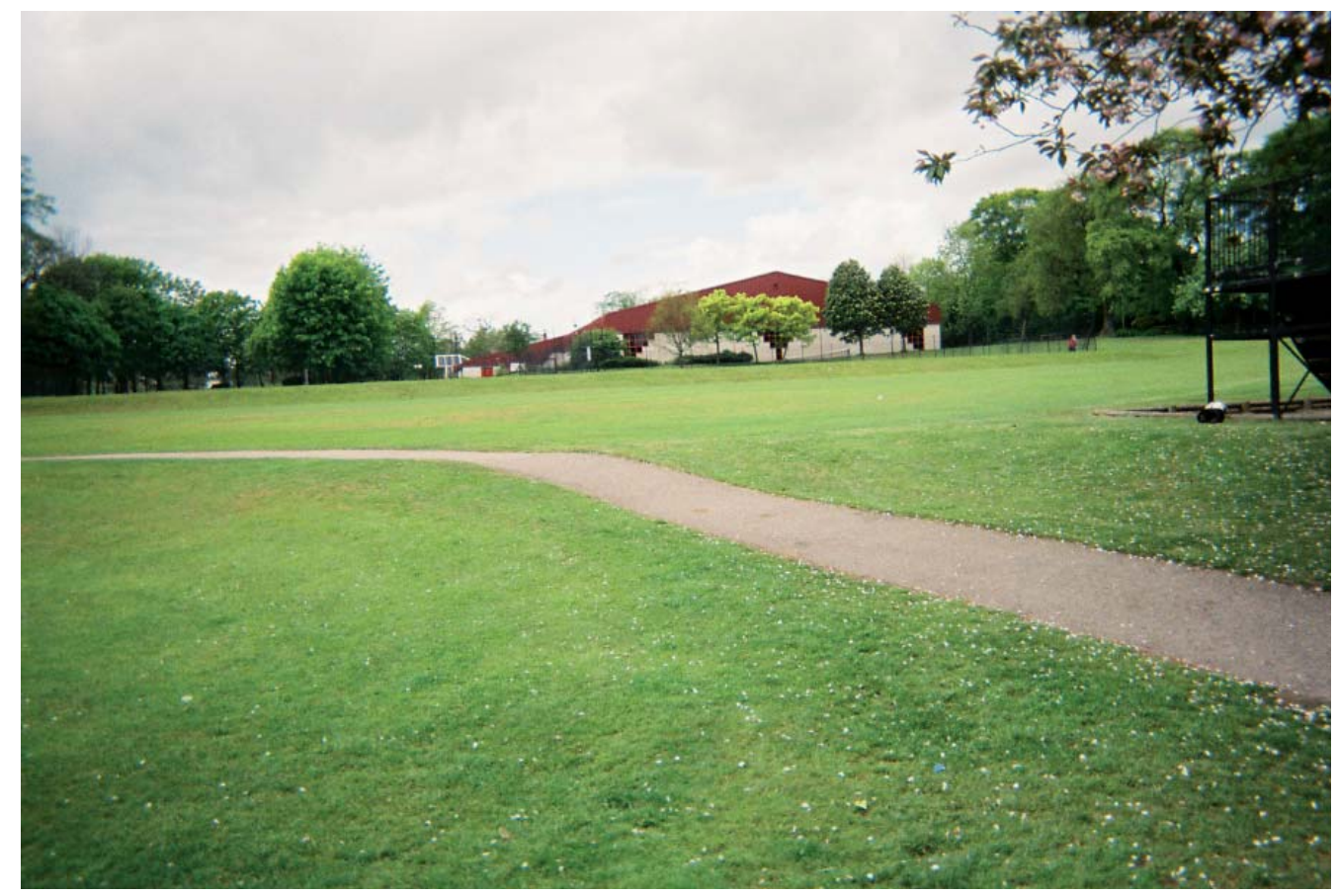
Grass Play Area in Victoria Park