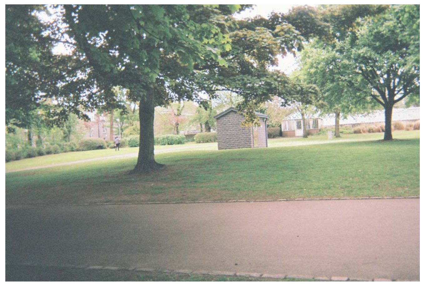
Lack of toiletsin Westburn Park