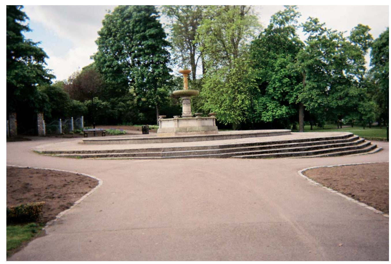
Fountain Victoria Park