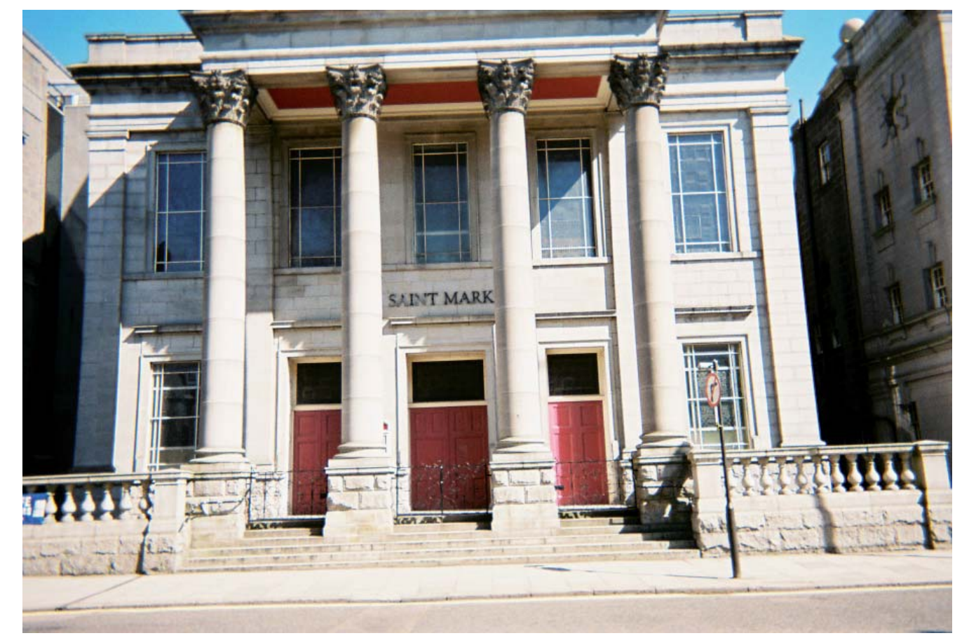
Granite Heritage St Marks