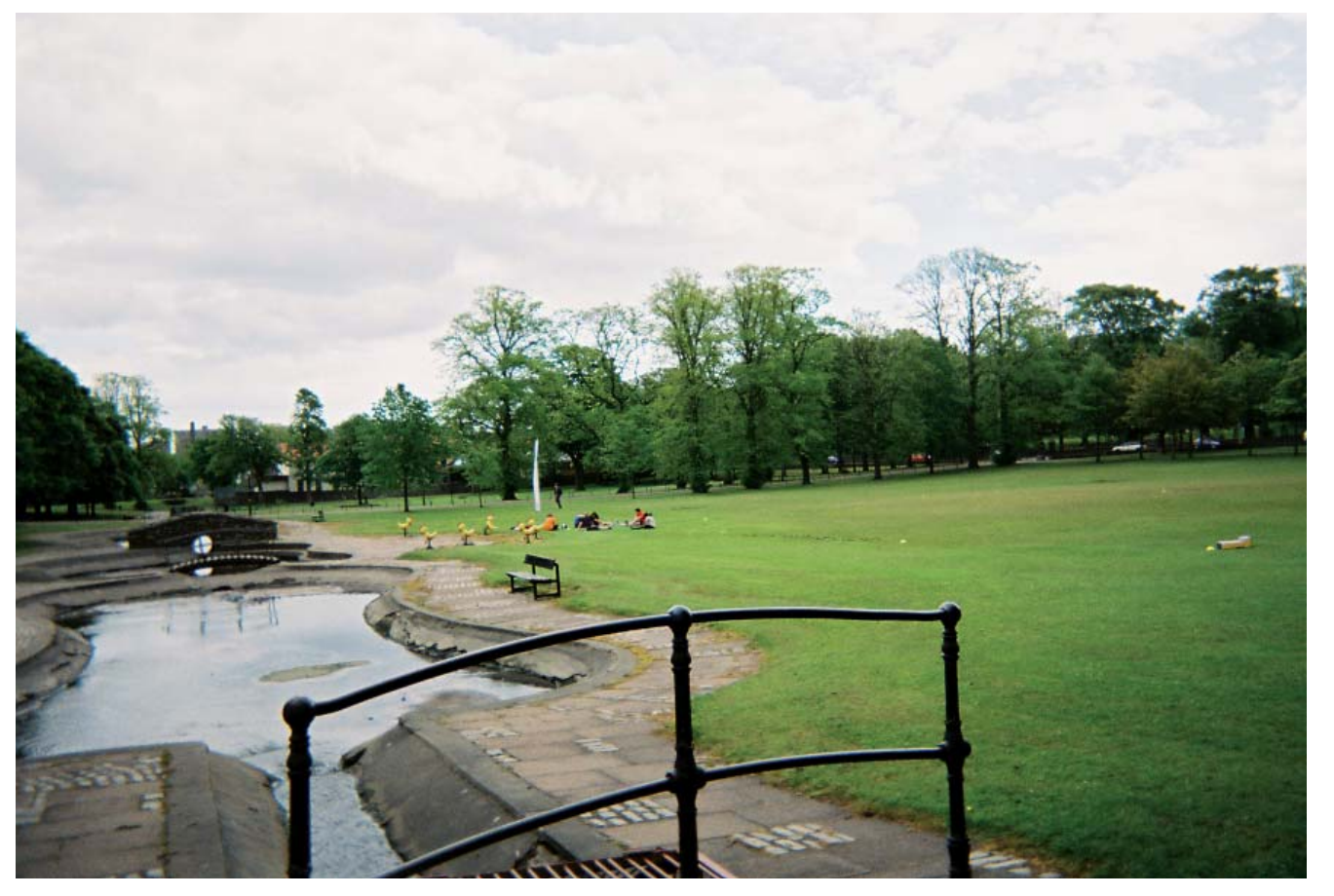
Lack of attractions in parks