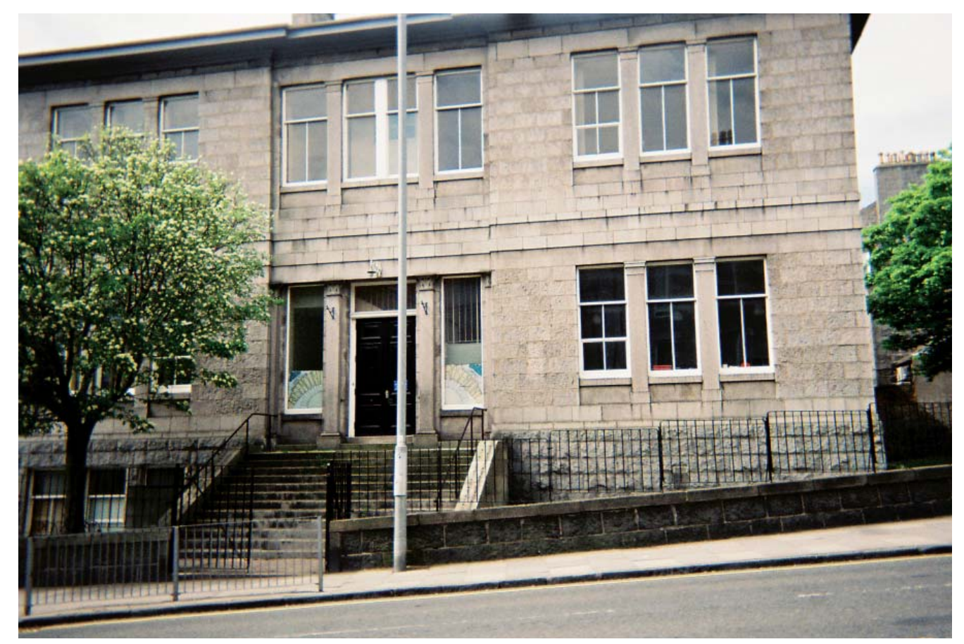
Rosemount Community Centre