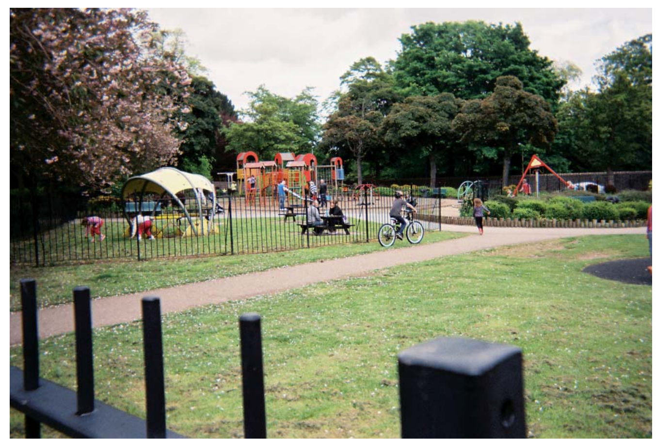
Childrens Play Area