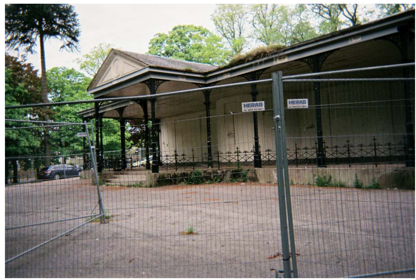
Derelict State of Westburn Villa