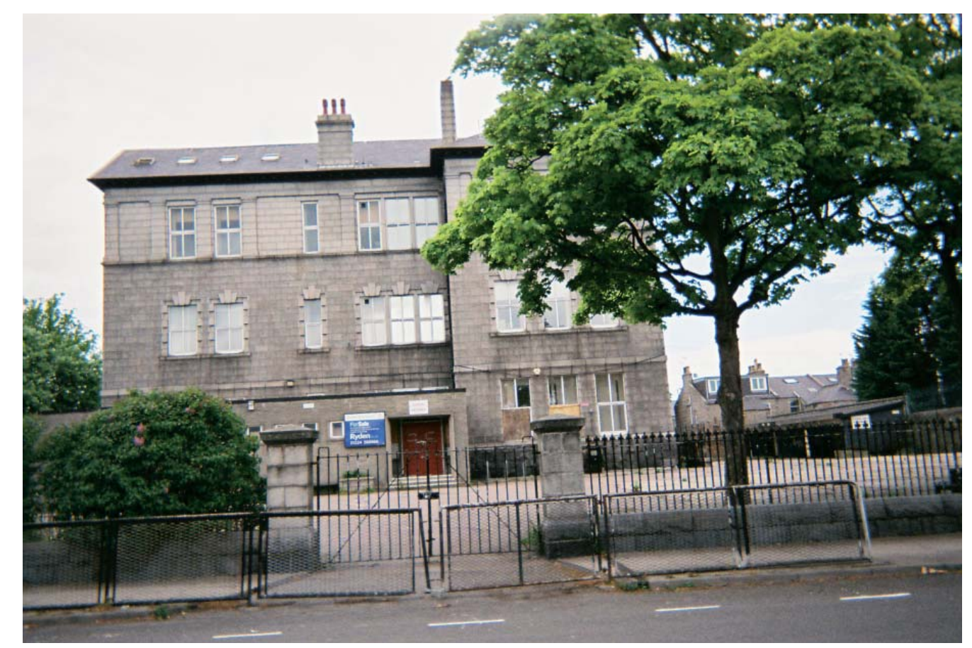
Former Mile End School