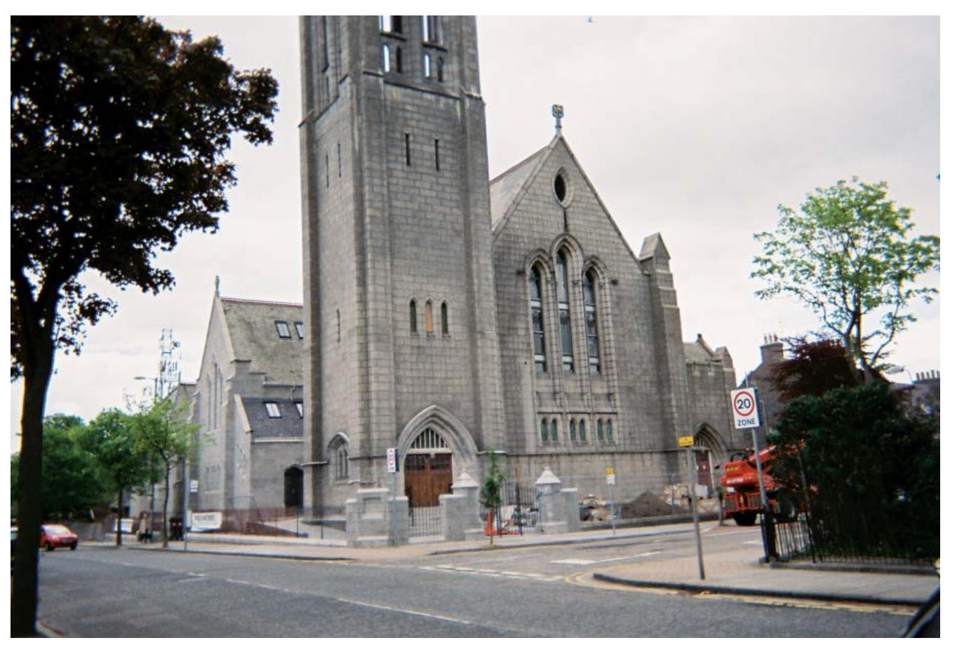
Former Beechgrove Church