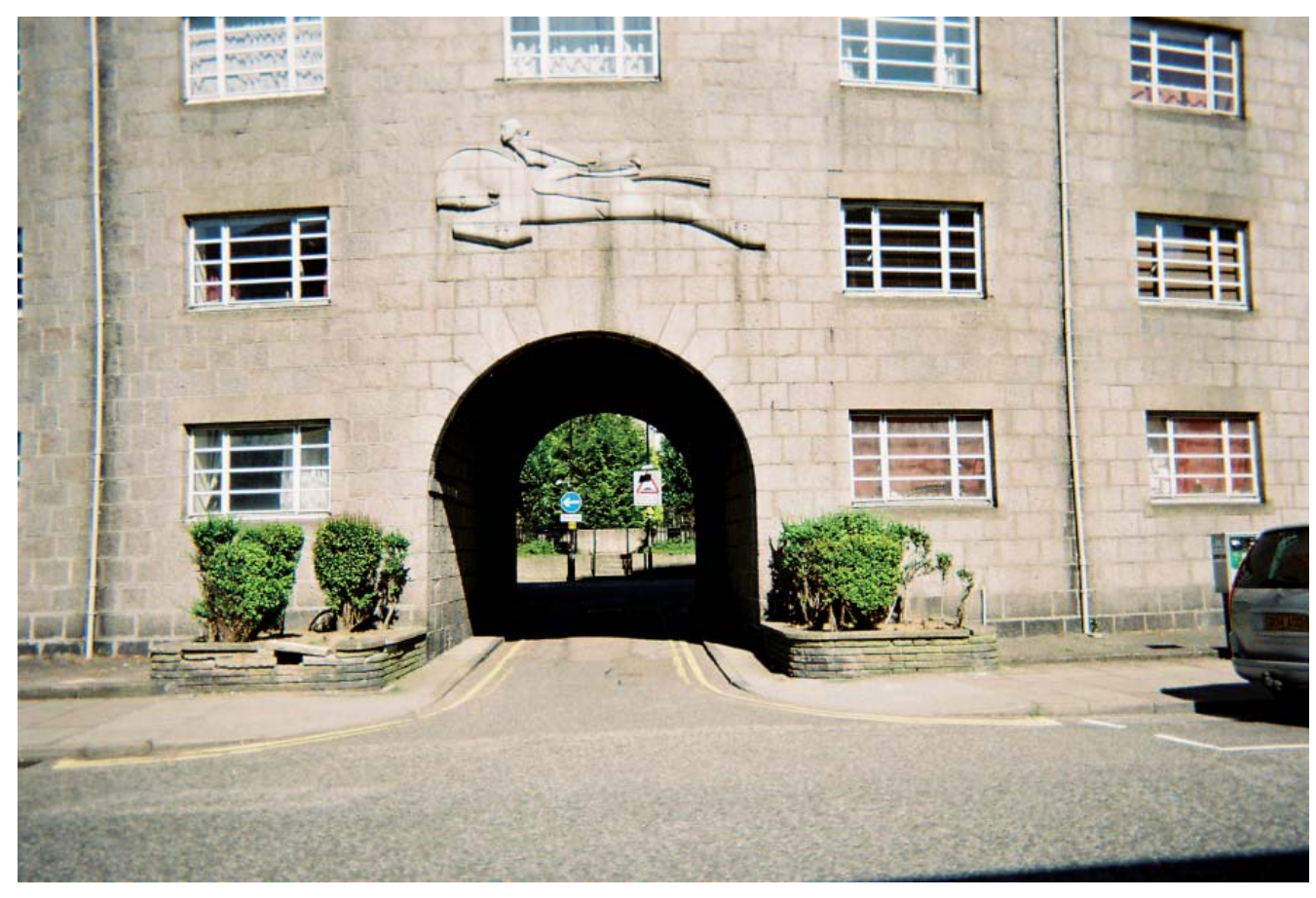
Poor upkeep of Council housing