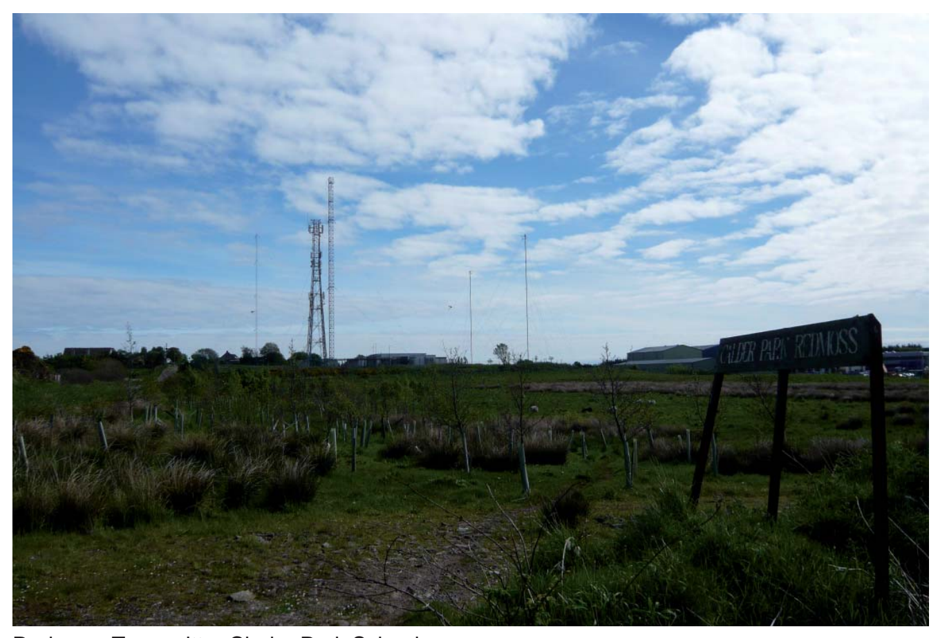
Redmoss Transmitter Clader Park School