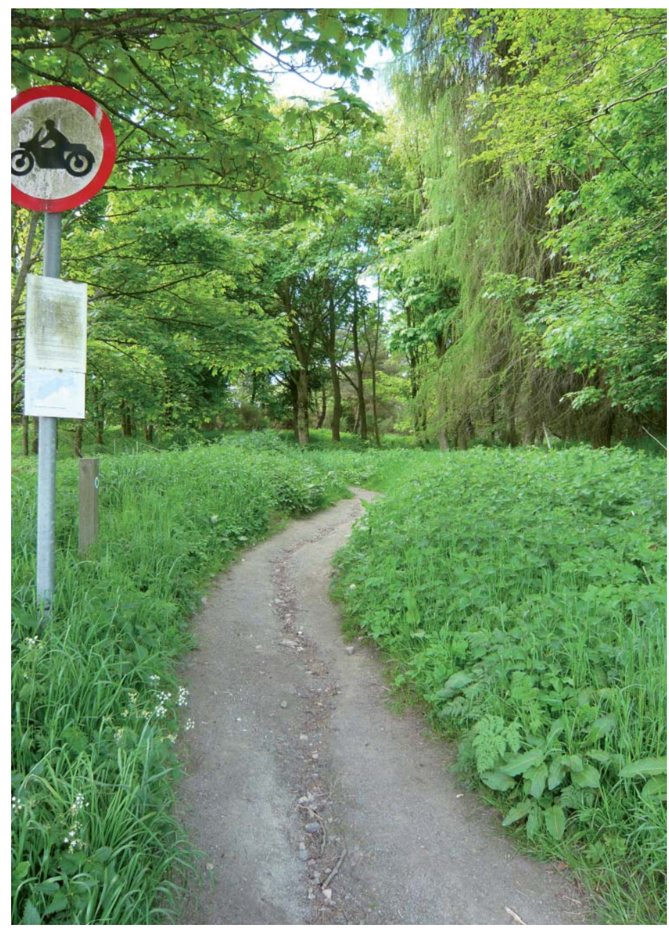
Kincorth Hill N R