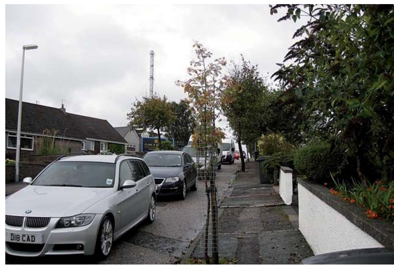
Congestion Redmoss Rd