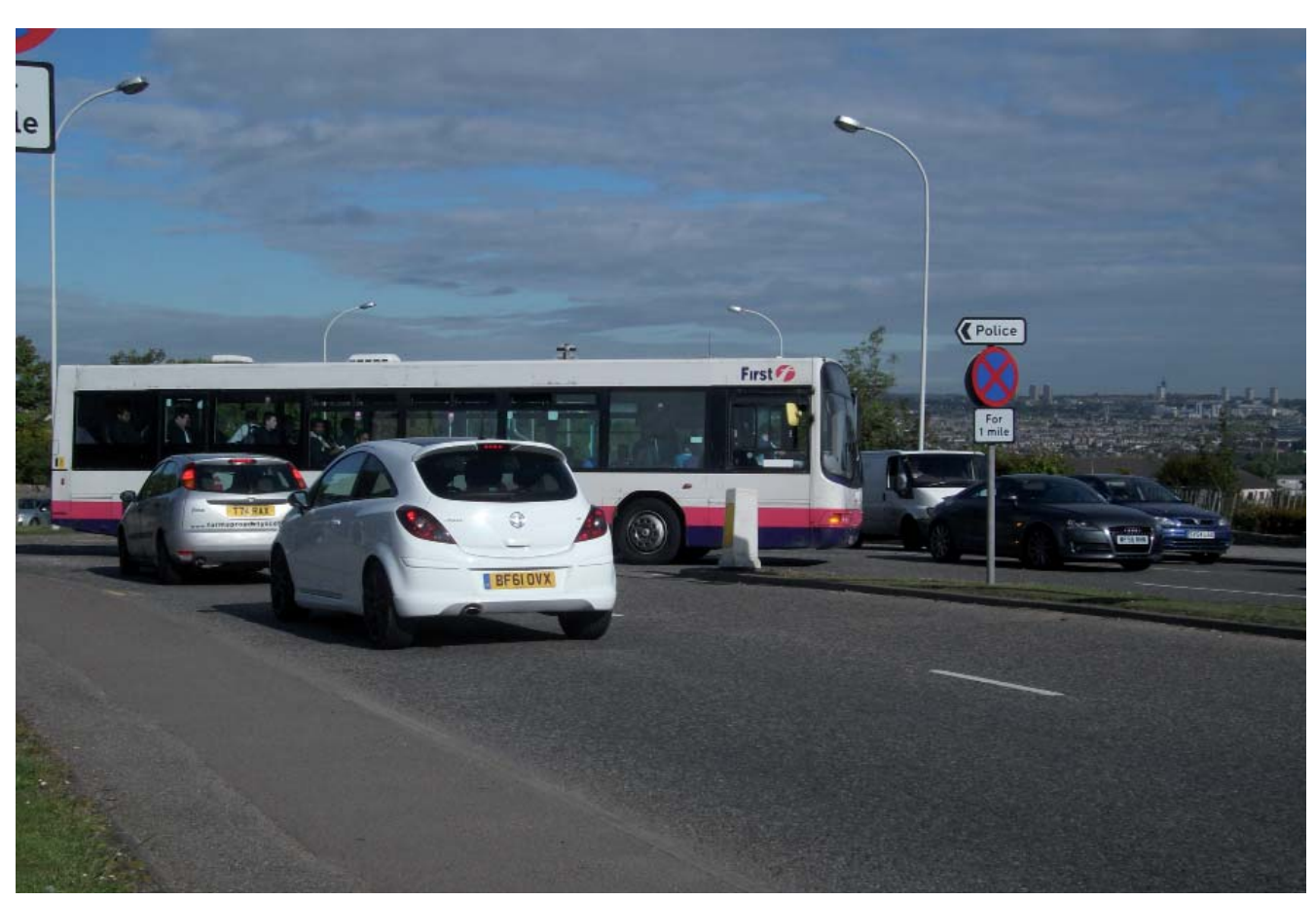
Right Turn Redmoss West Tullos