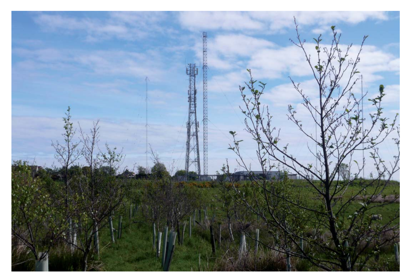
Calder Park Woodland