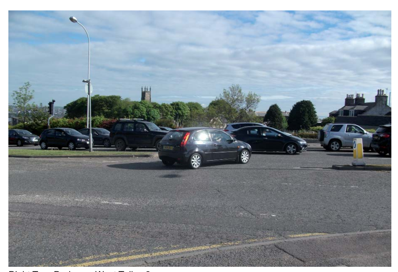
Right Turn Redmoss West Tullos 2