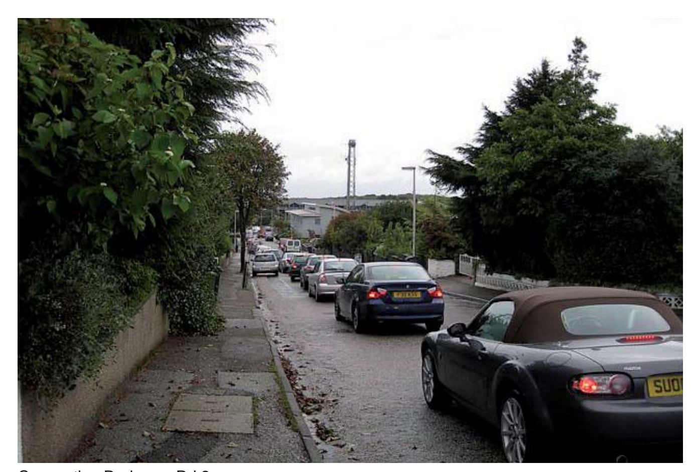
Congestion Redmoss Rd 2