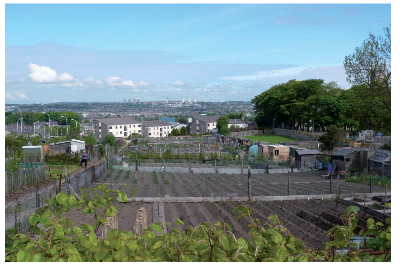
Nigg Allotments 2