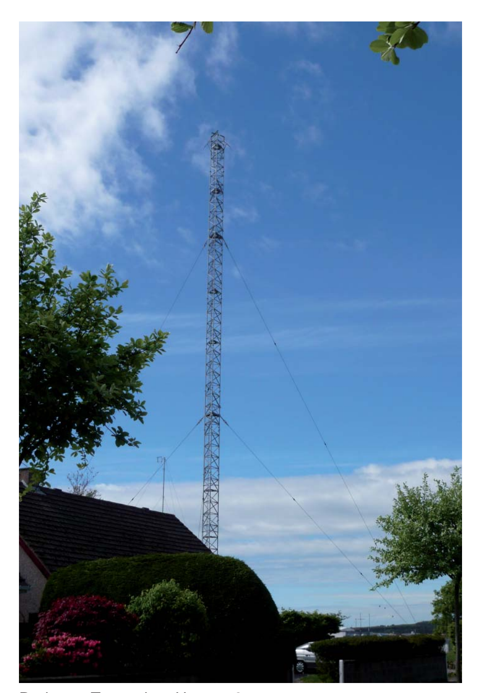
Redmoss Transmitter Houses 2