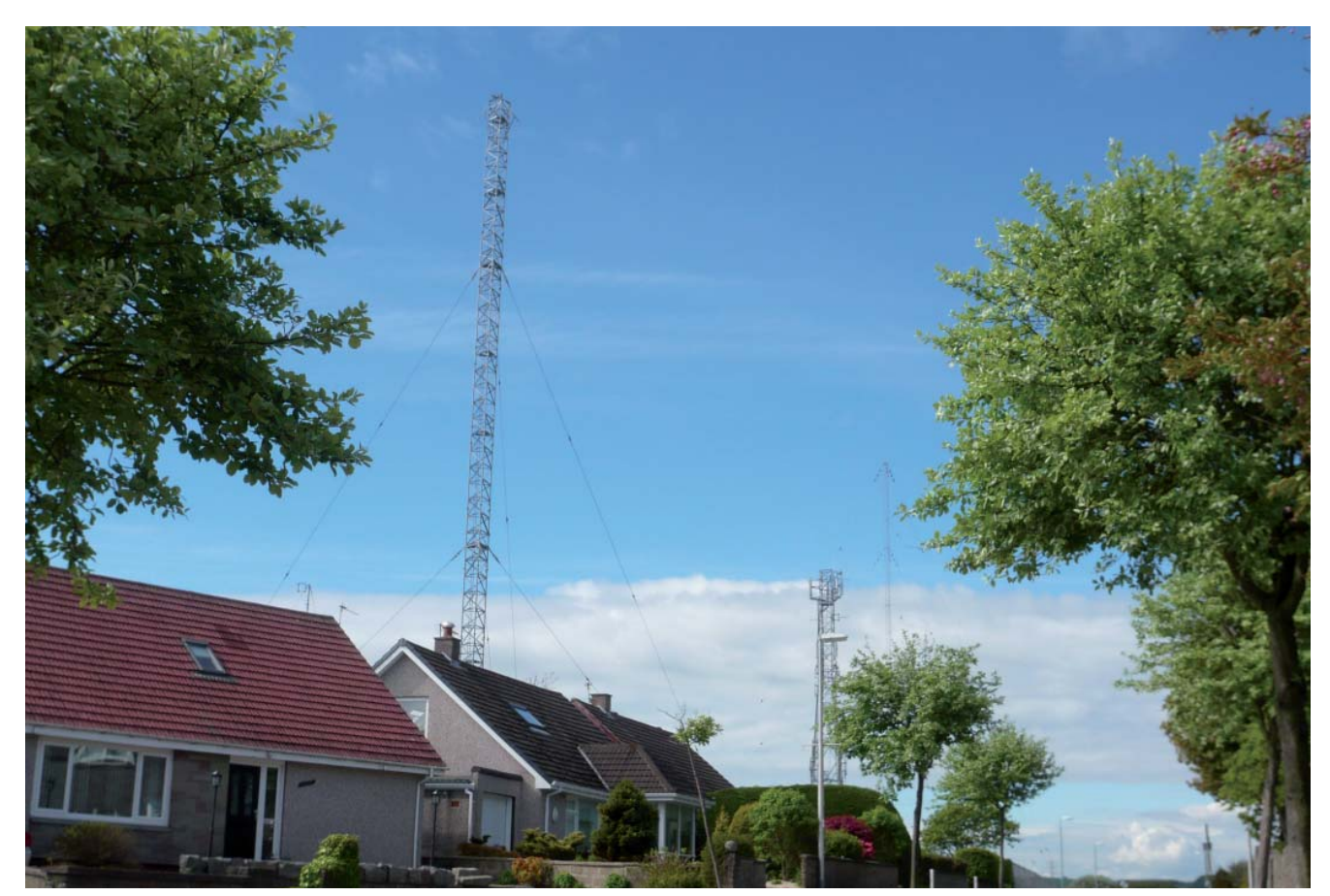
Redmoss Transmitter Houses