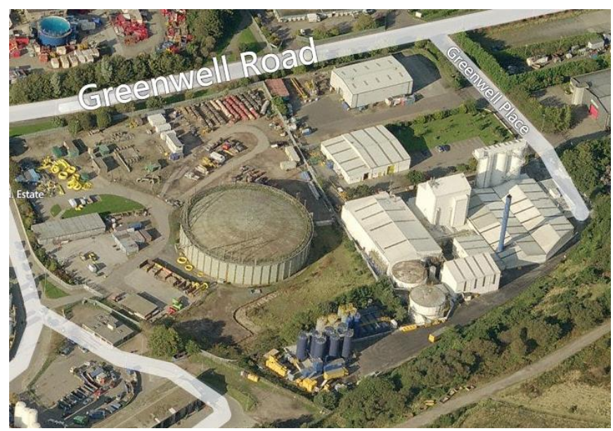
Arial view of the Aberdeen Gas Holder Site

The site comprises a large mothballed gas holder, associated structures and hard standing. SGN have identified potential for the gasholder to be decommissioned and as such the alternative future use of the site should be considered within the next Aberdeen Local Development Plan.