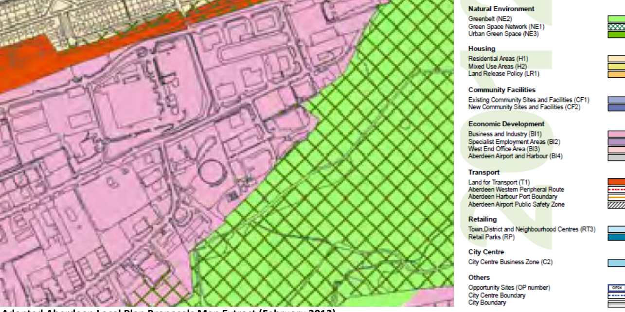
Adopted Aberdeen Local Plan Proposals Map Extract (February 2012)

We are concerned that the Council has not given due regard to the significant costs related to the decommissioning of the gas holder, dismantling the associated infrastructure and decontamination of the site which thus would require uses of sufficient value to ensure the redevelopment of the site is viable.