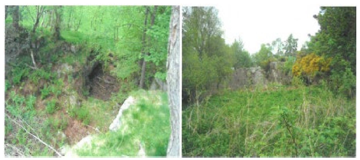
Figure 3: Current Day Photograph of Site Showing Former Quarries on Site

The site area is in the ownership of the proposer and is approximately 4ha.