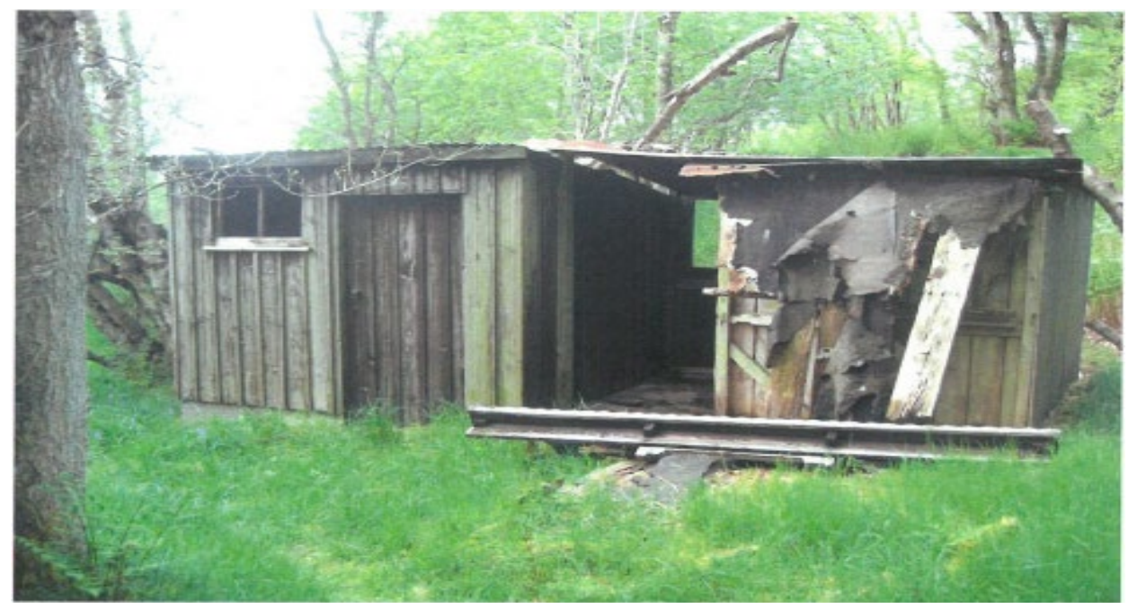
Figure 4: Current Day Photograph of Site Showing Shed on Site