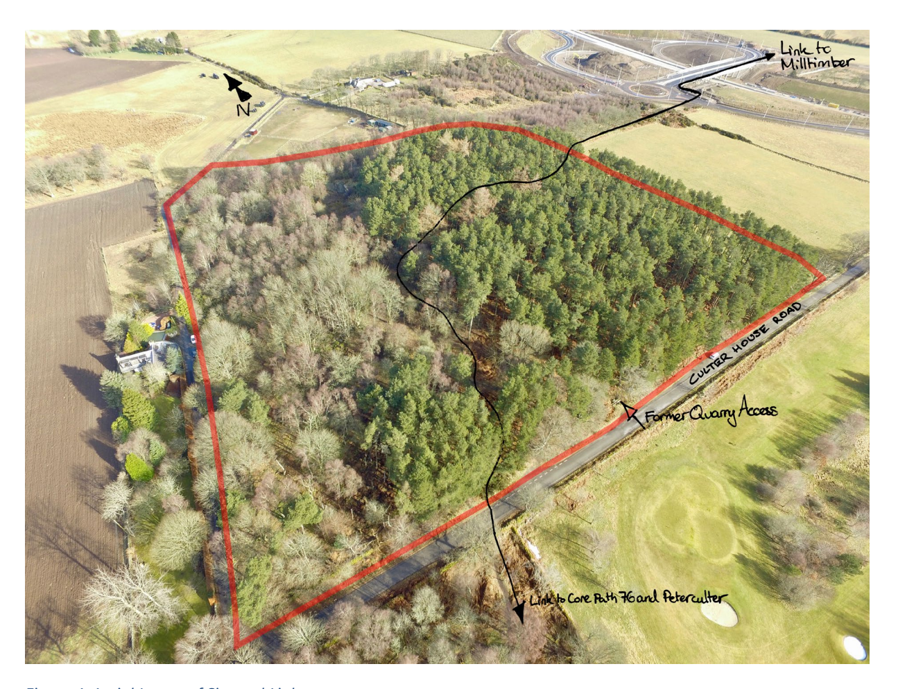
Figure 4: Aerial Image of Site and Links