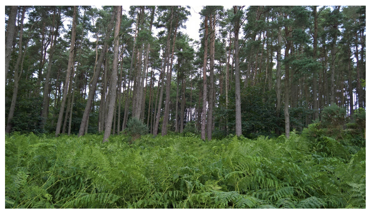
Figure 3: Coniferous Woodland to East of Site

A large portion of the eastern side of the site comprises a coniferous commercial plantation, the method of planting for this purpose ensures that trees grow tall and straight which is better for processing. Whilst there will be a requirement for trees to be felled, the housing has been sited on an area of coniferous woodland and would form part of a wider selective felling and replanting strategy. This strategy would provide compensatory planting as well as enhancing the biodiversity value of the site which can subsequently be enjoyed by the public who frequent the area on the desire paths through the woodland as well as supporting a diversity of insects increasing foraging opportunities.