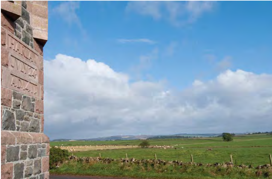
Illustration 4: Supposed site of the battle today.

Carrick succeeded Robert II as Robert III but had been injured, and the regency system continued. Albany, however, was increasingly being edged out of power by the Duke of Rothesay, Robert III's son. Rothesay died in mysterious circumstances: he was generally said to have been starved to death on Albany's orders. Robert III, alarmed at Rothesay's death, sent his other son, the future James I, to live in France, but he was captured en route by the English and held in captivity in England for 18 years. This left Albany as undisputed Regent of Scotland, king in all but name. Albany, the Stewarts and others associated with him spent the rest of their careers furthering their own interests as much as possible.