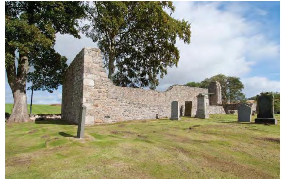
Illustration 16: The ruins of Kinkell Church today.

The Battle of Harlaw was, however, only one stage in the feudal struggle between these two sides. It is important to remember that the campaign against Donald was resumed