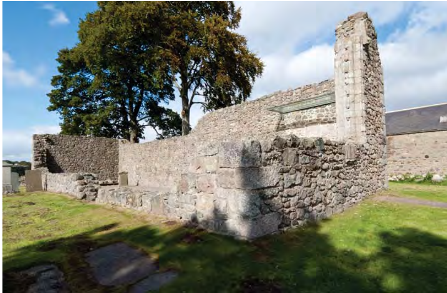
Illustration 15: The ruins of Kinkell Church today.

The main tactic seems to have been to push the lines hard against each other. It is often said that little, if any generalship can be discerned. Indeed, the role played by individual combat is often emphasized most, for example the duel between Sir Alexander Irvine of Drum and Red Hector of the Battles, at the end of which both lay dead.