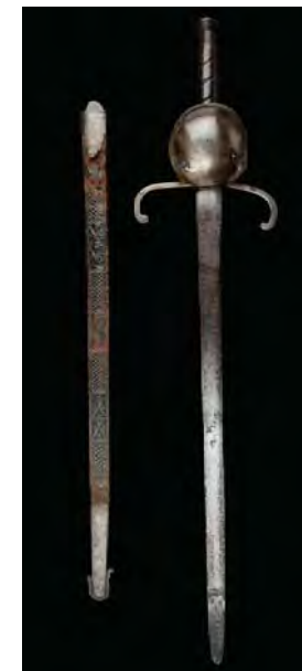
Illustration 8: Sword said to have been used at Harlaw, by the Tailors' Incorporation of Aberdeen.