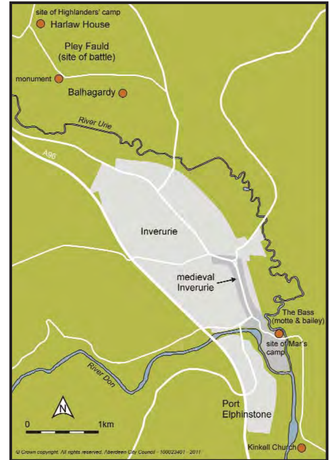
Illustration 5: Map of supposed site of battle and surrounding area.