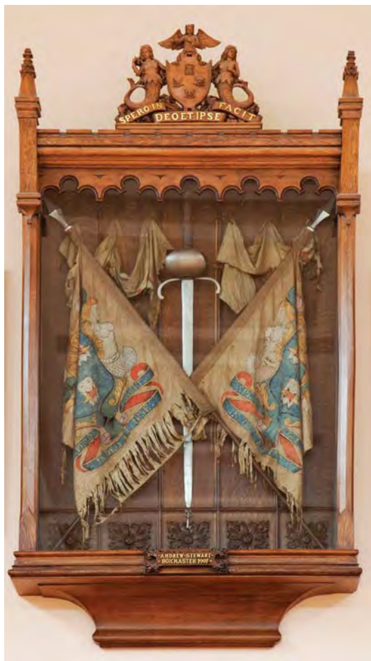
Illustration 6: Flag of the Weavers' Incorporation, said to have been flown at the battle.

(and no doubt much exaggerated in size by the rumours) would have been rife in the town for some time. The scene was thus set for the Battle of Harlaw.