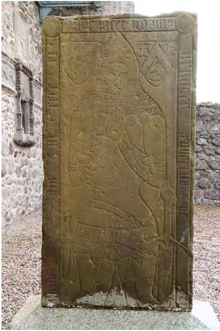
Illustration 11: Gilbert de Greenlaw's tombstone, showing typical armour from the period of the battle.