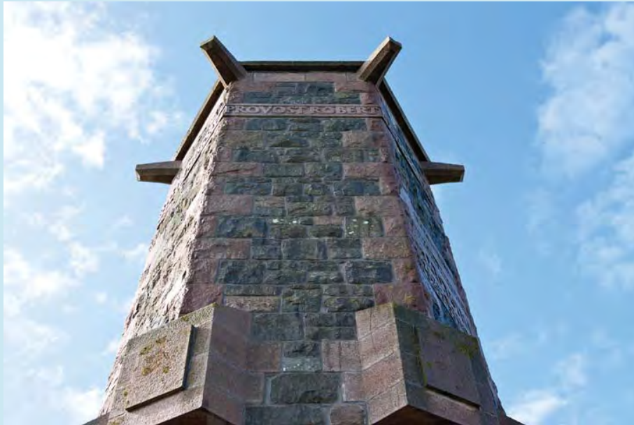
Illustration 2: Battle of Harlaw monument.