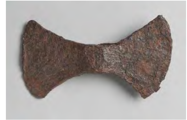
Illustration 13: Axe head, in Aberdeen Art Gallery & Museums Collections, said to have been found in the vicinity of the supposed battle site.