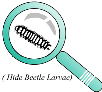
(Hide Beetle Larvae)