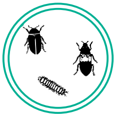
Hide Beetle, Larder Beetle & Larvae -Actual Size

The types commonly found in dwellings are the Hide Beetle and the Larder Beetle.